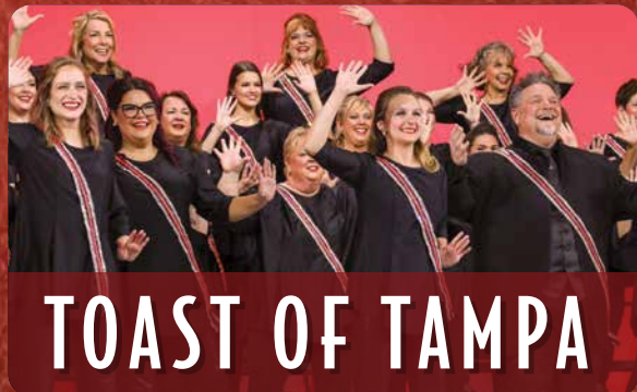
TOAST OF TAMPA