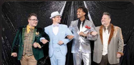
THREE AND A HALF MEN